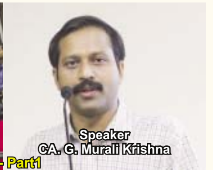
Delegates In FEMA Regulations - Lending / Borrowing- Part1