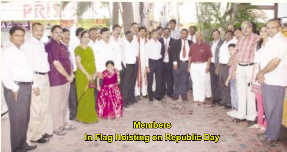
Members In Flag Hoisting on Republic Day