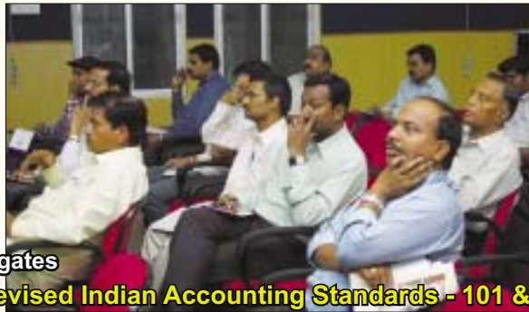
In Revised Indian Accounting Standards - 101 & 105