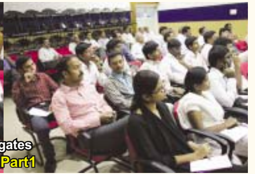
Delegates In FEMA Regulations - Lending / Borrowing- Part1