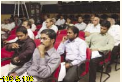
In Revised Indian Accounting Standards -103 & 108