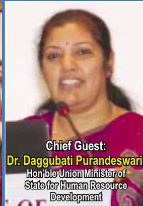
Chief Guest: Dr. Daggubati Purandeswari, Hon'ble Union Minister of State for Human Resource Development